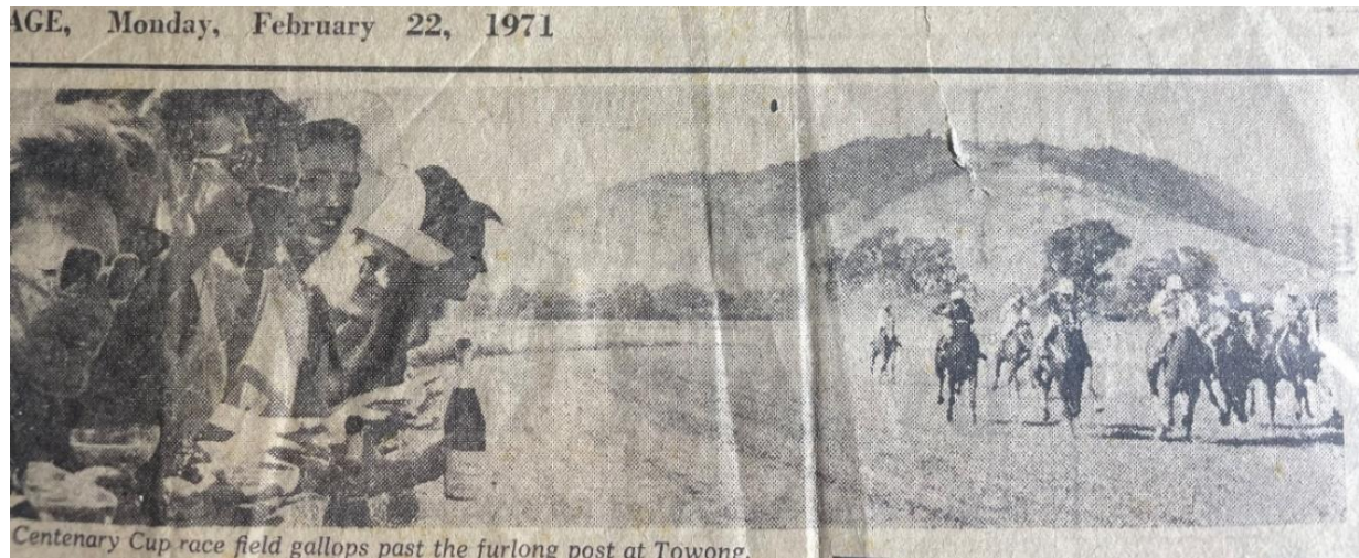
Image 1. Centenary Cup Finish, Towong, 1971, Towong.

Moab, the local “toast of Towong” won the Centenary Gold Cup at Towong in 1971, in front of a jubilant crowd.