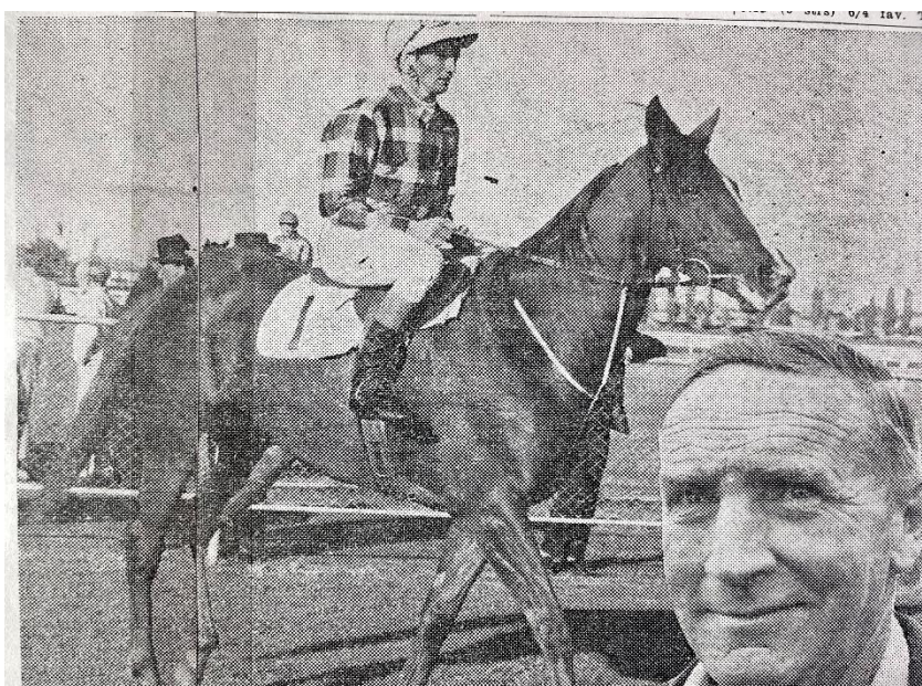
Image 4. 'Rarin' to Go'.